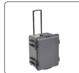
carrying case (optional)

*Other output port (1/2G, 1/4G, 1/2NPT, 1/4NPT) can be customized